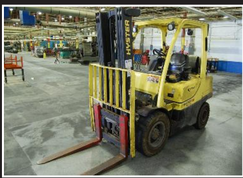
Hyster H60 Fortis fork lift; 5700 lb capacity, L.P. powered, 3 stage mast, 170" lift height, side shift, 42" forks, 2638 hours, serial L177B23754F