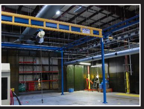
Gorbel 2000 klb capaxcity free standing hoist; Coffing JLC 1 ton hoist, approximate 34' span, approximate 57' runway, 10' hook to floor