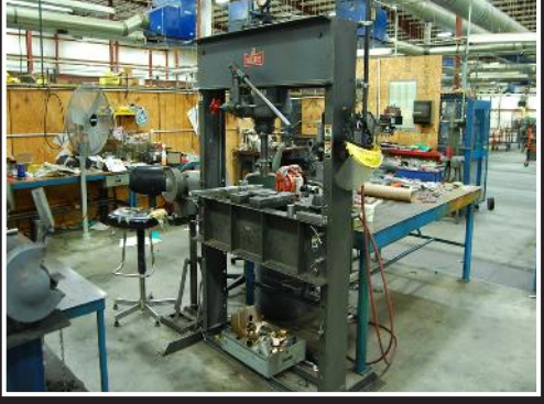
Dake H frame press