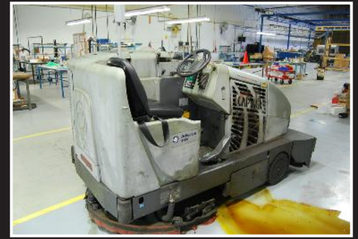
Nilfisk Advance 4800 floor sweeper/ scrubber; serial 1890810