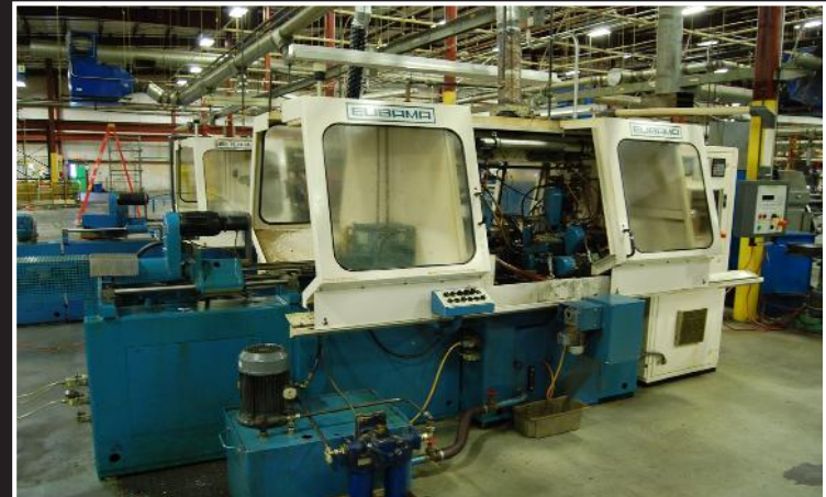
Eubama S8 rotary transfer machine; 1998 vintage, 2T, serial 81354