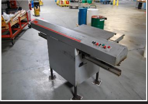
SMW Spacesaver 12.65 autoload bar feed