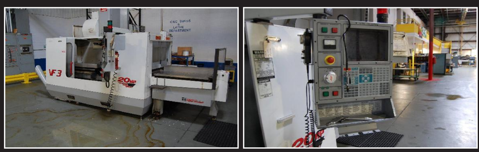
Hass VF3 CNC machining center; 2000 vintage, 24 position tool holder, 19" x 40" table, automatic pallet changer, 20 h.p. Vector Dual drive, Haas programable coolant, serial 21536