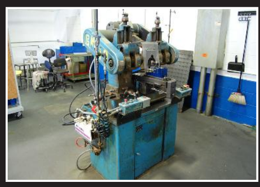
Barker model AMP milling machine; spindle speed 350 3060 rpm's, coolant, SPX Hytec hydraulics for Hardinge 5C collet holder, serial 1505B