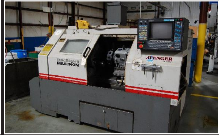
Cincinnati Milacron Avenger 200 MT CNC turning center; 12 position tool holder, Acramatic 850 SX controls, serial 3650AMT96-0009