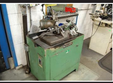
Mohawk model 308 large drill grinder; serial 308182