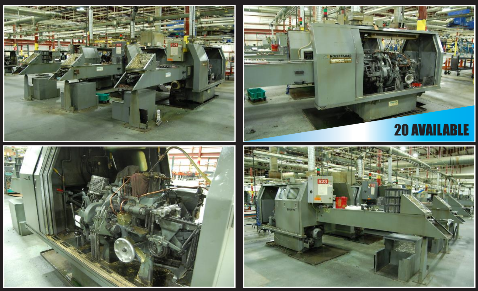
(10) Davenport HP 5 spindle CNC screw machines; Noise Tamer, spindle pick off and deburring, bar capacities = round @ 0.875", hex @ 0.750" and square @ 0.625"