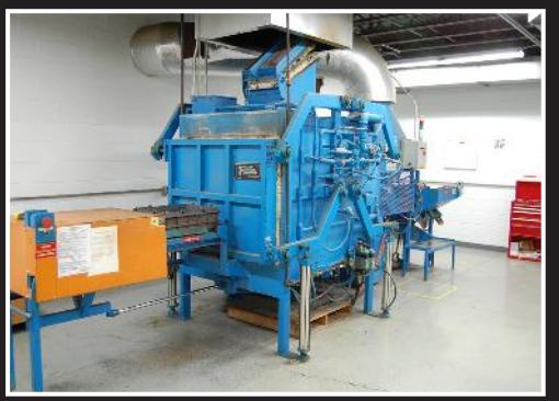
Refractory Maintenance Corp heat treat furnance; natural gas fired, Honeywell controls and components, air accuated doors