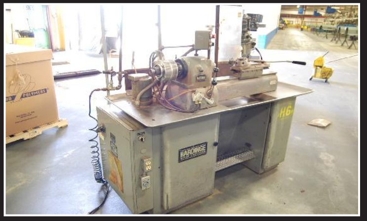
Hardinge model DSM-59 super prcision engine lathe; 1 hp, 8" swing, 18" center to center, 1v1/4" hole through center, Gusher coolant system