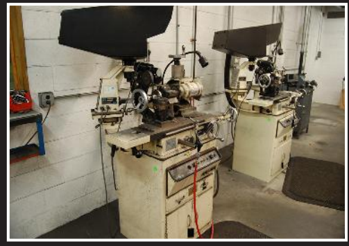
Royal Oak form relief grinder; 12" optical comparitor attachment, Accurite X/Y readout, Uiversal Form relieving fixture, serial 25R0244