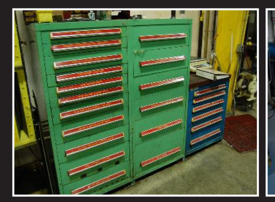
Stanly Vidmar tool cabinets; assorted sizes