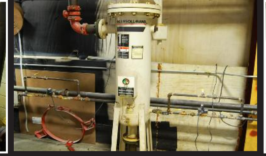
Ingersoll Rand TR1500CHE compressed air filter, 1500 scfm, 200 psig