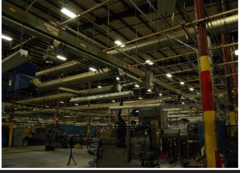
Square D bus bar and plugs; hundreds of feet