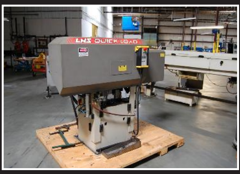
LNS Quickload bar feed; 1997 vintage, serial 24278