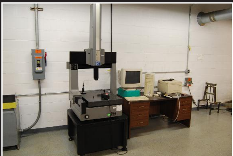
Brown & Sharpe Micro Val PFX coordinate measuring machine; 22" x 29 1/2" granite surface table, serial 112218