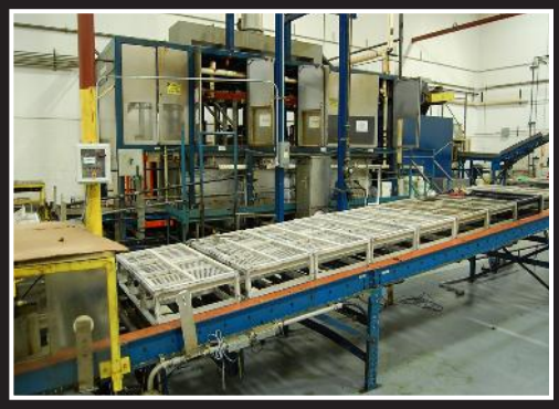
FRI Systems finshing and cleaning system; (2) stage washing, (2) stage rinsing, (1) stage drying, powered conveyor with 40" x 20" baskets