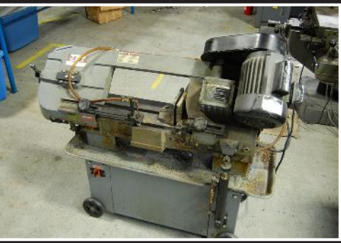
Jet HUBS 7MW horizontal/ vertical band saw; 3/4 hp, single phase, 1994 vintage, serial 414459