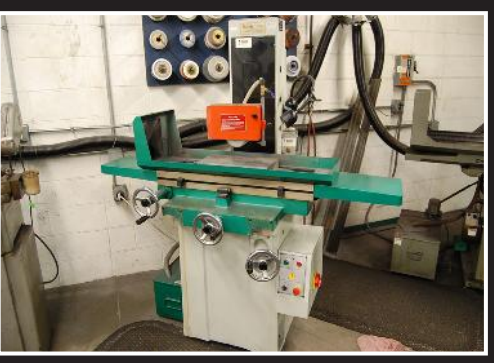
Grizzly model G3155 surface grinder; 2 hp, spindle speed 3450 rpm's, 16" x 8" table, manual magnetic chuck, 2006 vintage, serial 06051354