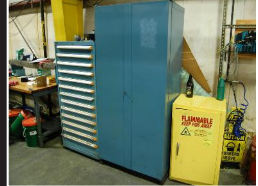
Rousseau 13 drawer tool cabinet, 2 door stoarge cabinet, 12 gallon Eagle flammable cabinet