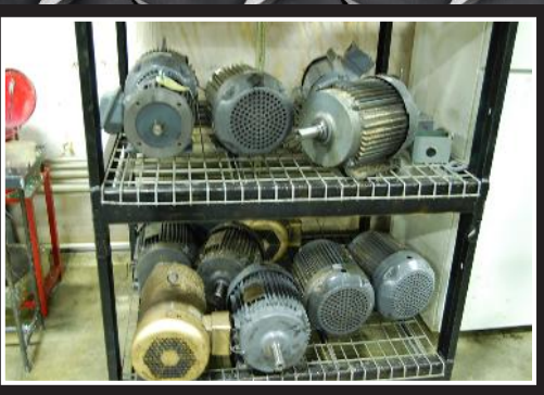
assorrtted brands and hp's of electric motors

Drilling & Tapping machine; custom made, consists of Ettco model 500 and model 4 drills, ARO model 47276 twin spindle with rotary table