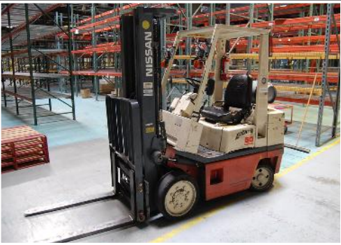
Nissan KCPH02A25PV Enduro 50 fork lift; 4400 lb lift capacity, 187" lift height, 3 stage mast, side shift, 42" forks, 4957 hours on meter, L.P. powered, serial KCPH02P008761

Toyota 3FGL20 fork lift; 3000 lb lift capacity, 2 stage mast, 48" forks, 120" lift height, L.P. powered, serial 3FGL25-12813