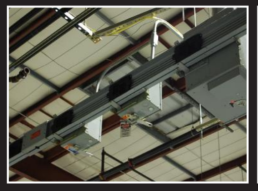
hundreds of feet of bus bar and plugs