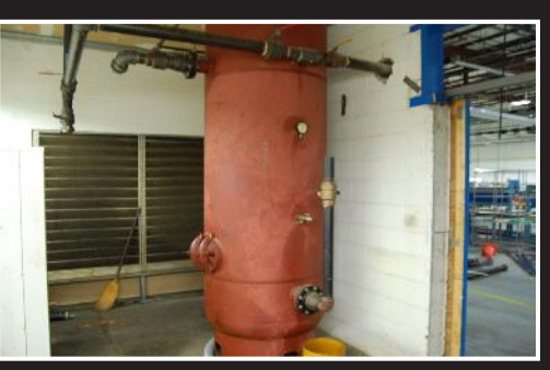
Air receiving tank; 1994 vintage, 150 psi rating, 9' x 40" diameter