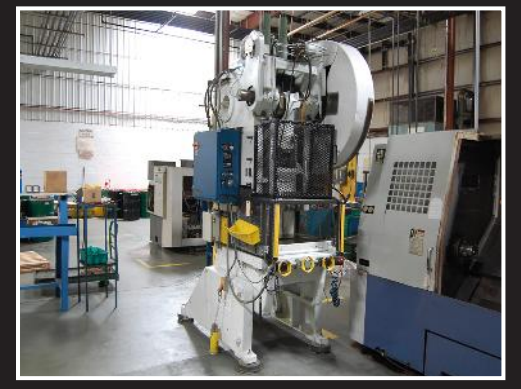
Bliss C60 OBI punch press; slide adjust 3, shut height 14 1/4", Cieco PC1-100 controls, Micro Safe light curtains, air counter balance, 4" shut height, serial H61646HP47139