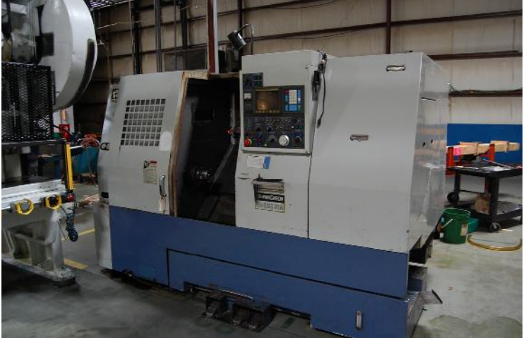
HWA Cheon H1 ECO 31A CNC turning center; 1994 vintage, IO Position tool holder, Fanuc Korea O-T series controls, serial 94051753