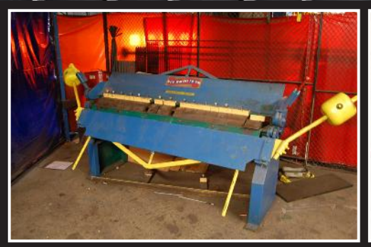
Jet SBR30N shear/ brake/ roll combo; 20 gauge x 30" capacity, stock 754031