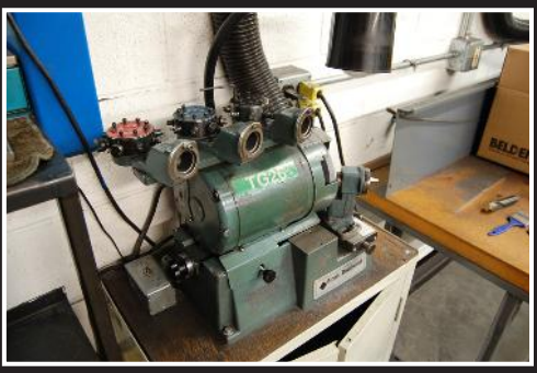
Black Diamond bench top tool grinder