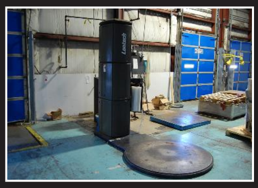
Lantech Q300 stretch wrapper; 115/20, 60" table, serial Q2075