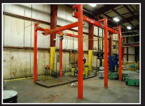
Snap Trac 1/2 ton hoist; freestanding 150" span x 16' run, hook to floor 8'