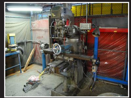
Nantong vertical milling machine; 10" x 54" table, spindkle speed 70 - 600 rpm's, Mitituyo x/y readout, left to right power feed, serial 41586