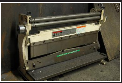
National V6-7212 box & pan brake; 12 gauge capacity, 73" mouth, serial 225-498