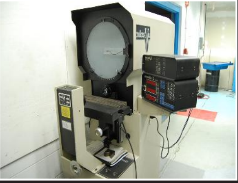
Micro Vu M103 optical comparitor; 14" screen diameter, Micro Vu x/y/z readout, 5" x 18" table, serial 5901