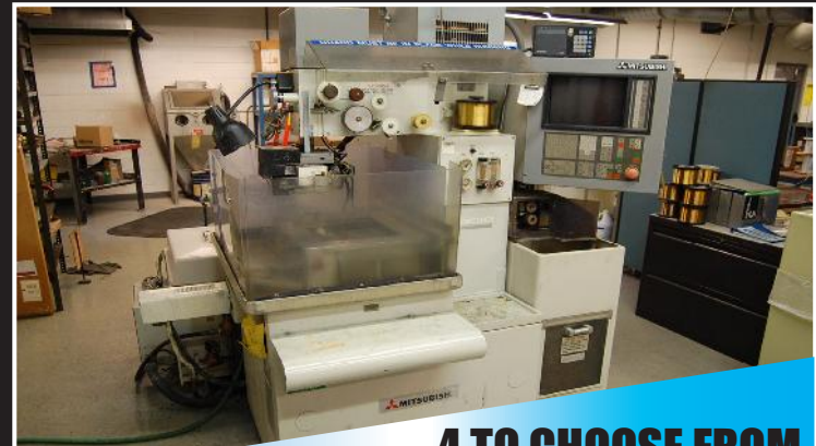
4 TO CHOOSE FROM

Mitsubishi DWC90CR wire EDM machine; 1996 vintage, Sony X readout, serial 559D1388