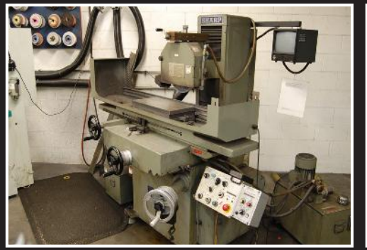
Sharp model SH920 hydraulic surface grinder; 10" x 19 1/2"electro magnetic chuck, 1999 vintage, serial 90905-04