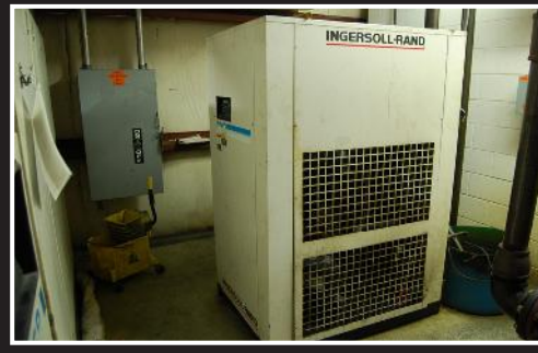
Ingersoll Rand DXR750A compressed air dryer; 1996 vintage, serial 96BDXR0794