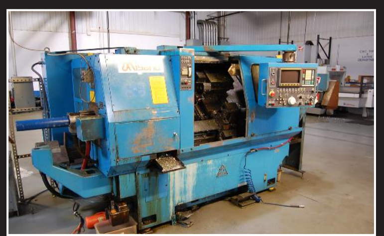
Miyano JNC 45 CNC machining center; Fanuc OT controls, chip conveyor, coolant, 8 position tool holder, serial JN450553