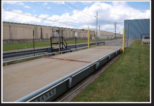
Fairbanks truck weigh scale; 130" x 69', monitored by camera, (2) exterior displays, (8) load cells