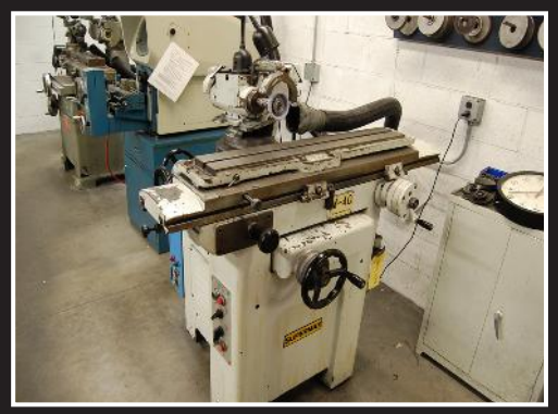
Top Work Super Max M40 grinder, 1995 Vintage, 5" x 37" table, serial 2467