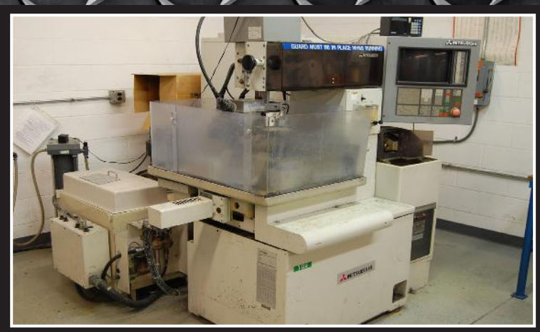
Mitsubishi DWC90CR wire EDM machine; 1996 vintage, Sony X readout, serial 069D1422