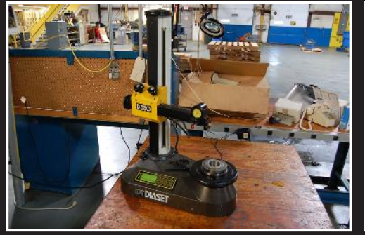
KPT Diaset D350 toolset measuring system