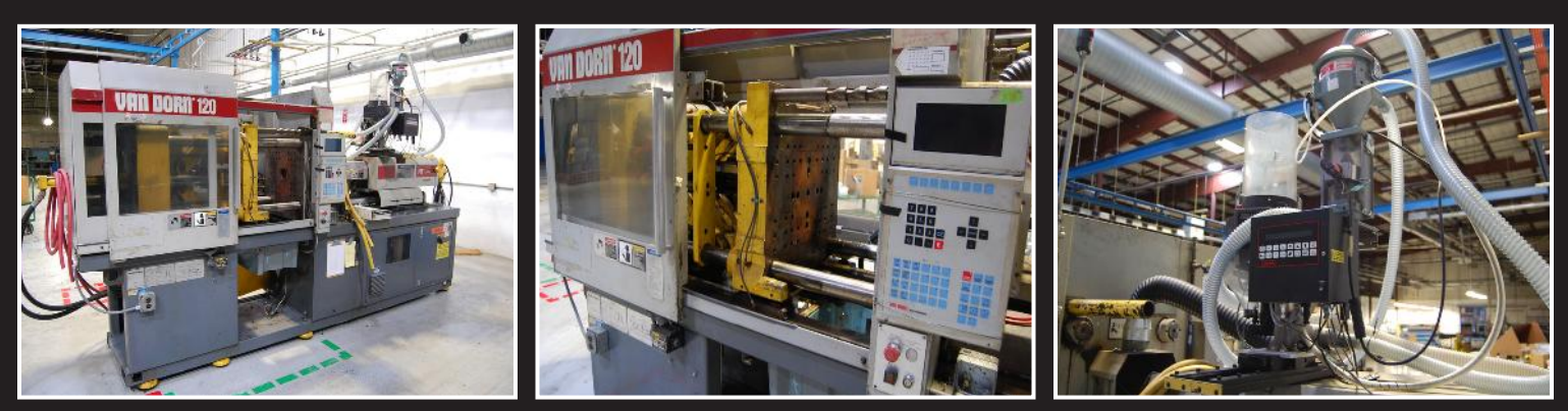
Van Dorn 120-HT-8F injection molder; 1994 vintage, RS rotating screw, clamp tonnage 230 max, 20 ounce injection unit capacity, serial 547