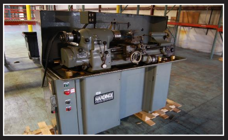
Hardinge Super Precision engine lathe; 1 1/4" hole through center, 10" swing, 18" center to center, carriage feed