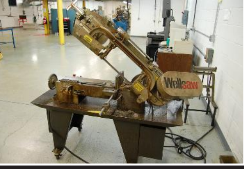
Wellsaw 613 horizontal band saw; .75 X .032 x 98.5 blade size, 13" window, serial 1414