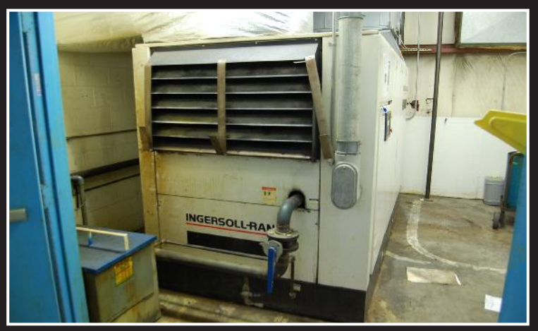
Ingersoll Rand SSR EPE 200 2S rotary air compressor; 200 hp, 125 psig rated operating pressure, 990 cfm capacity, 78,870 total hours & 60238 load hours, serial FF1951V00169