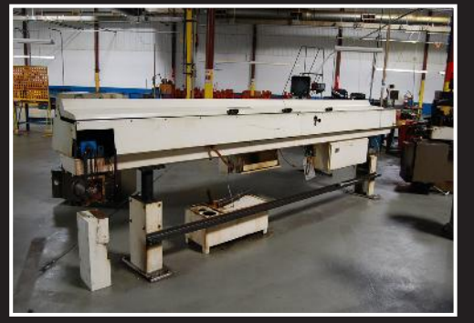
Automated Productions 225/4200 bar feed; 1994 vintage, serial 225-9502