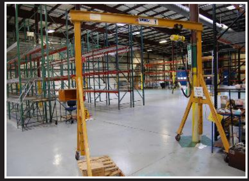
Spanco 1 ton "A" frame portable gantry; 114" wide with adjustable height, Budgit 250 lb electric hoist