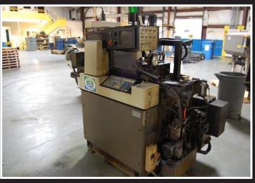
Cincom L16 Citizen milling machine