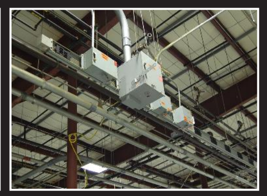
hundreds of feet of bus bar and plugs