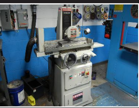
Harig (by Bridgeport) Ballway hydraulic surface grinder; 6" x 18" manual magnetic chuck