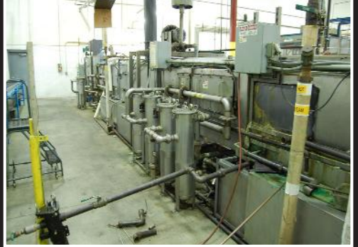
CDF parts washing machine; 23" x 8 1/2" opening, approximate 50' length, includes (6) Rosedale filtration units