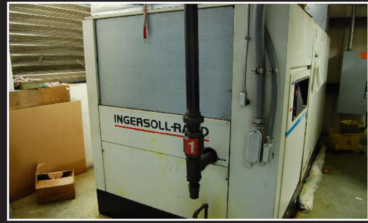
Ingersoll Rand SSR-EP150 rotary air compressor; 150 hp, 1245 psig rated operating pressure, 670 cfm capacity, 59,781 total hours, 37,052 load hours, serial F13326U96157