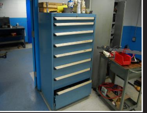
Rosseau 8 drawer tool cabinnet