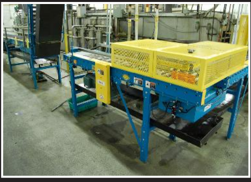
Bastian Automation Engineering conveyor system consisting of; (1) 12" capacity Hytrol powered conveyor, (1) 10' section, (1) 7' section with 20" capacity, (1) 45' section with 20" capacity