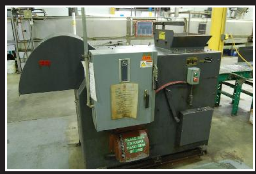
McKenzie floor type chip conveyor seperator; serial L2552