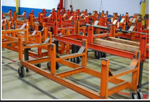
several stock carts