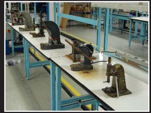
large selection of various tonnage Dake & Greenerd arbor presses